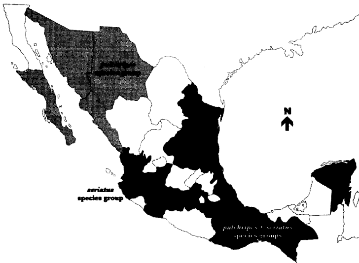
Figure 2. Distribution of pulchripes and seriatus species-groups in Mexico.